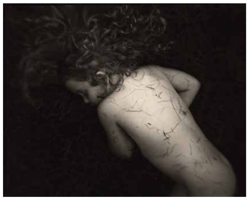
Sally Mann Fallen Child, 1989

The poster in Rona Yefman 's installation reads 'FAMILY The grey zone. something between gross and beauty'. Approaching the camera as a tool of invention rather than documentation, Yefman spent over 15 years collecting and producing photographs, videos, and objects that illustrate the intimate and complex relationship between the artist and her sibling. In My