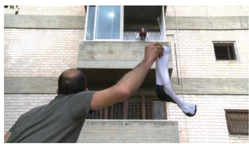
Guy Ben-Ner Soundtrack (video still), 2013