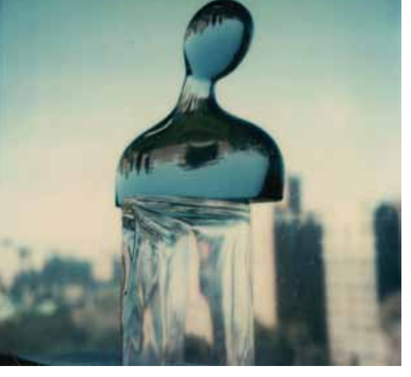
André Kertész October 6, 1979

truth. Recovered from the depths of the artists' psyche, the resulting photographs and videos are demonstrations of what is psychologically, socially, and culturally possible when aspirations and disappointments are made manifest and fantasies are embraced.